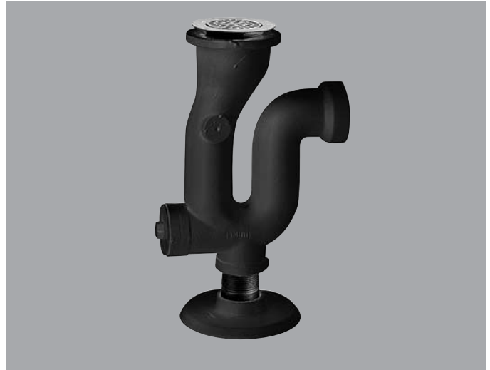
7798.020 / .030 IS FOR ENAMELED IRON SERVICE SINK