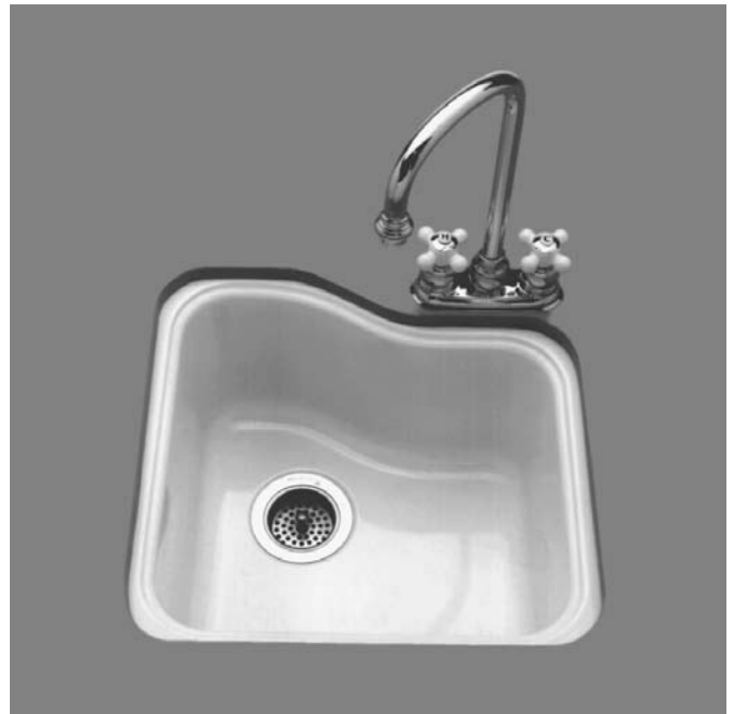
Undercounter Mount Installation (faucet not included)

SEE REVERSE SIDE FOR ROUGHING-IN DIMENSIONS