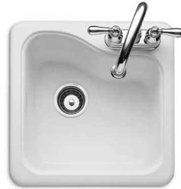
Top Mount Installation (faucet not included)

* See faucet section for available models