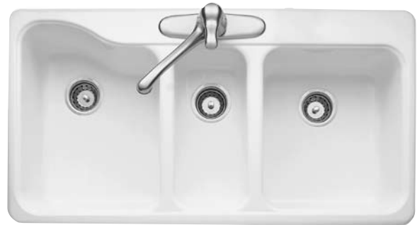
Top Mount Installation

SEE REVERSE SIDE FOR ROUGHING-IN DIMENSIONS