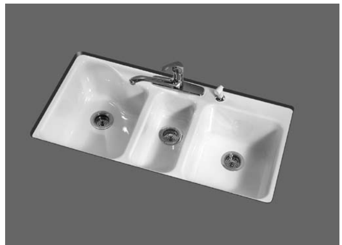
Undercounter Mount Installation