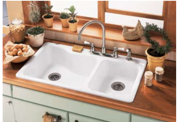
Shown here as a Top Mount (faucet not included)

SEE REVERSE SIDE FOR ROUGHING-IN DIMENSIONS