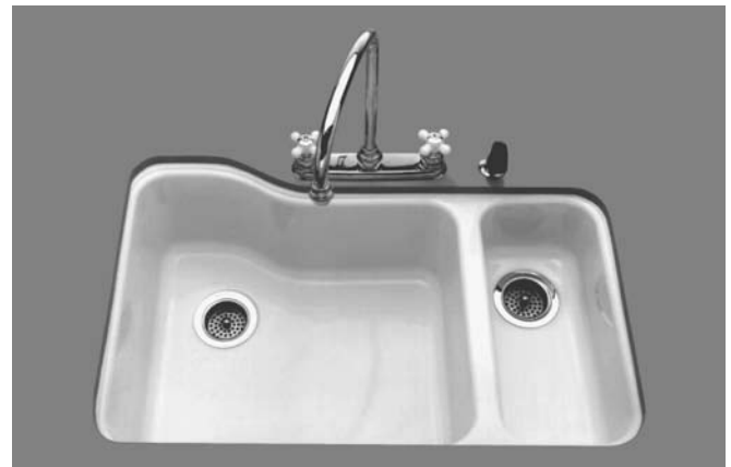
Undercounter Mount Installation (faucet not included)