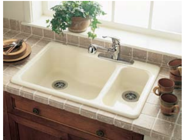
Top Mount Installation (faucet not included)

SEE REVERSE SIDE FOR ROUGHING-IN DIMENSIONS