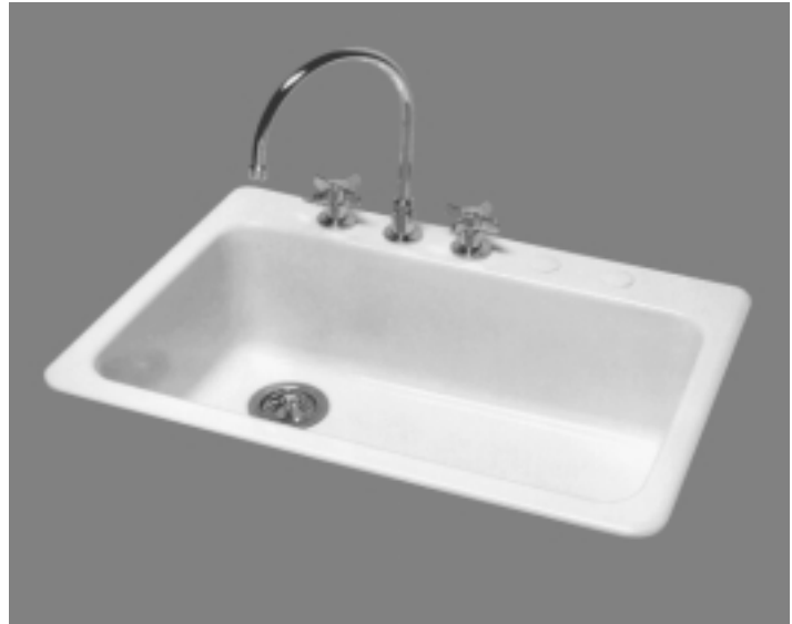
Shown with 7230.152H Heritage Kitchen Faucet with Cross handles (not included)

See reverse side for roughing-in dimensions