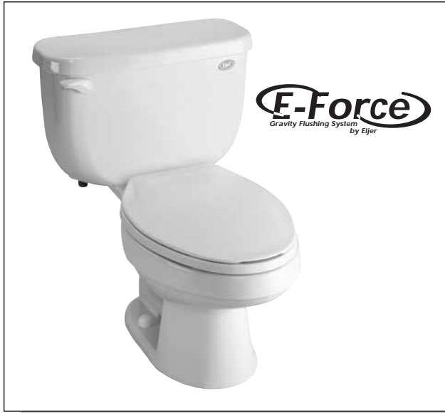
Patriot Elongated-Rim Toilet, 14" Rough-In (091-2195)

Note: Dimensions May Vary +/- 1/2" and are Subject to Change or Cancellation