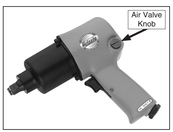
Figure 1. Model G5347

Attach any ½" drive socket onto your air impact wrench. To change the rotational direction, push the air valve knob. To adjust the torque setting, turn the air valve knob from 0 to 5, 5 being the highest setting ( Figure 1 ). Connect the impact wrench to an air line regulated at 90 PSI.