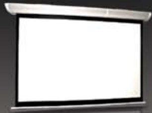
100" Screen with Integrated LCR Speakers