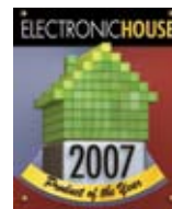
Winner: Epson PowerLite Home Cinema 1080