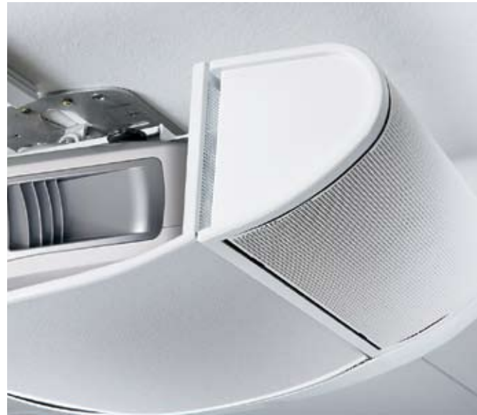
Surround speakers hidden in the projector's integrated speaker cradle