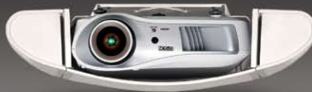
1080p Projector with Integrated Speaker Cradle