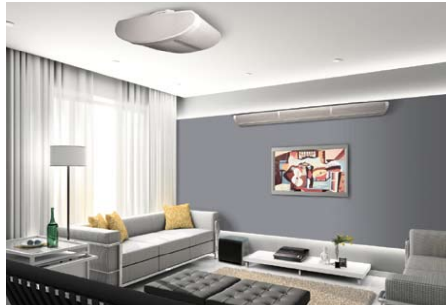
Screen disappears into the screen casing