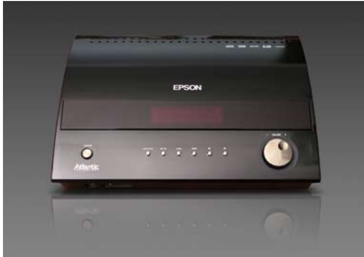
AV Controller with built-in DVD and 1080p up-conversion

This system's command center is a user friendly audio/video controller complete with built-in progressive scan DVD player and AM/FM tuner. The elegant, black-graphite unit is equipped with dual HDMI inputs and 1080p up-conversion on all inputs; ideal for connecting your essential components including Blu-Ray or HD DVD players, High Definition game systems and cable or satellite receivers.