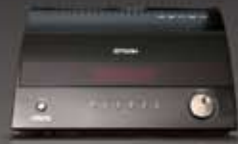
AV Controller with built in DVD Player