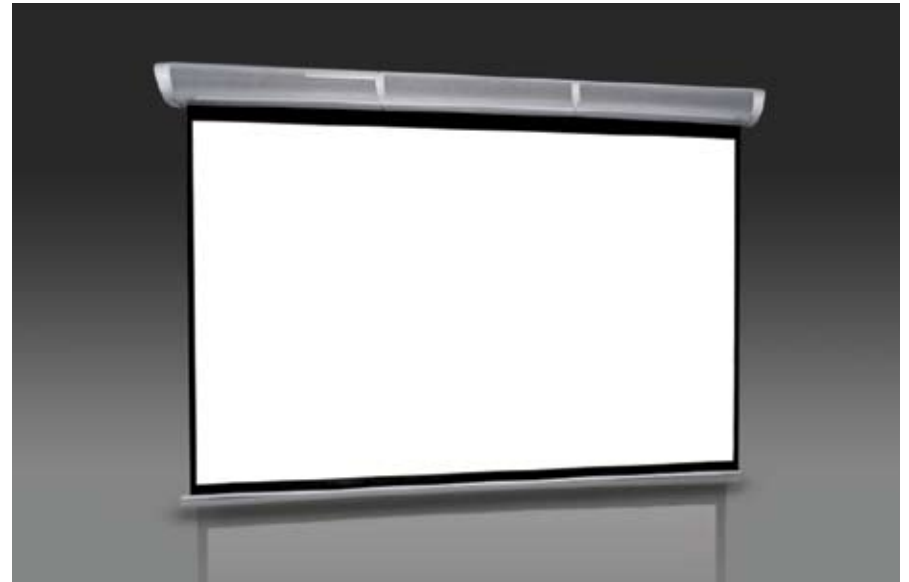
100" Motorized Screen with Integrated LCR Speakers

Through its innovative, integrated design, the Ensemble HD has solved – once and for all – the dilemma of how to seamlessly mount speakers in your room.