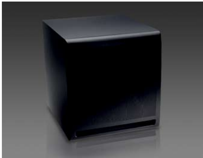
10" subwoofer with 5.1 channels of amplification

The location of the subwoofer in a room can greatly influence its performance. In order to produce the highest performance in virtually every room, the system includes proprietary "bass-smoothing" technology, creating smooth, equal bass throughout your room and ensuring the Ensemble HD subwoofer always sounds clean, powerful, and detailed.