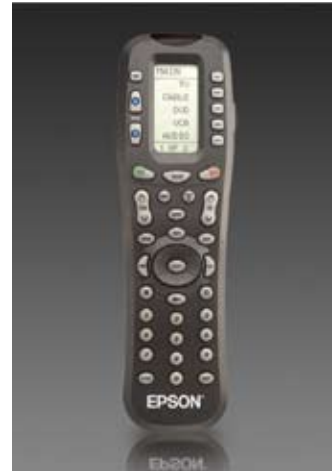
LCD Remote Controller

Ensemble HD is simply the smartest way to convert your family room, multimedia room or basement into a first class entertainment center.