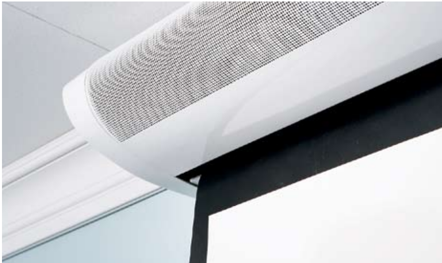
Elegant speaker design blends with room decor

Engineered by Atlantic Technology, the Ensemble HD's left, center and right channel speakers are unobtrusively integrated into the screen's clean, contemporary, white housing. Utilizing precise 4 ½" midrange drivers and 1" horn-loaded tweeters, the front stage speakers deliver highly articulate, intelligible speech and on-screen action effects. To achieve pristine, consistent sound fidelity in virtually any room, the Ensemble HD includes a proprietary, 4-position Location Equalization Control. This cutting-edge technology allows users to adjust the sound to fit their room and ensures that listeners perceive the dialog and action as coming from the screen- not above it!