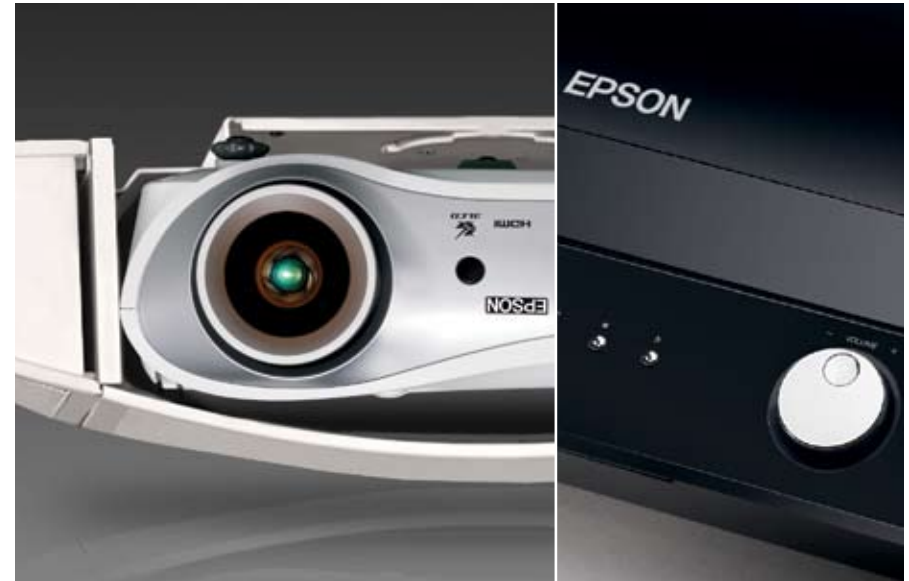
Epson 1080p projector with state-of-the-art optics

There has, quite simply, never before been a system that combines the Ensemble HD's unprecedented accessibility with such extraordinary performance.