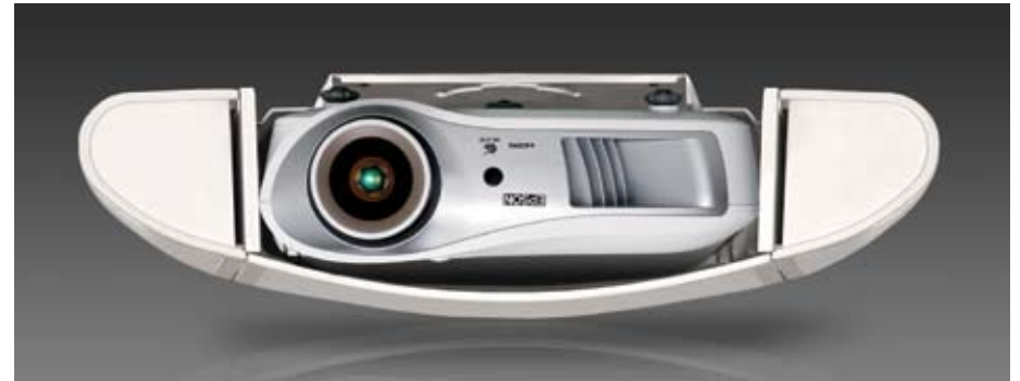
Integrated surround speaker cradle