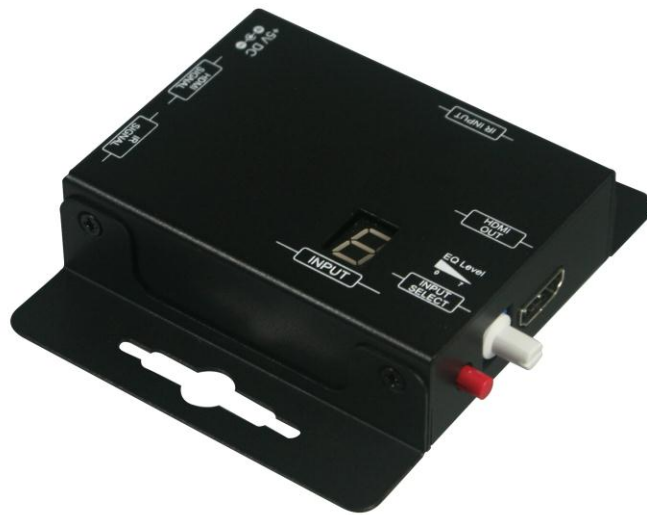
Model #: HDMI-C5SW-R

HD ready 1080p HDMI HDCP 7.1CH Audio TRUEHD