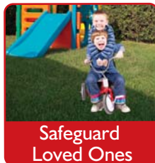
Safeguard Loved Ones