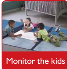
Monitor the kids