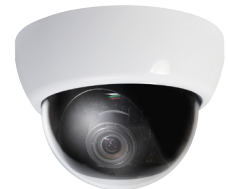
Camera shown with snap-on Chameleon™ Cover