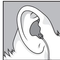
Right ear shown