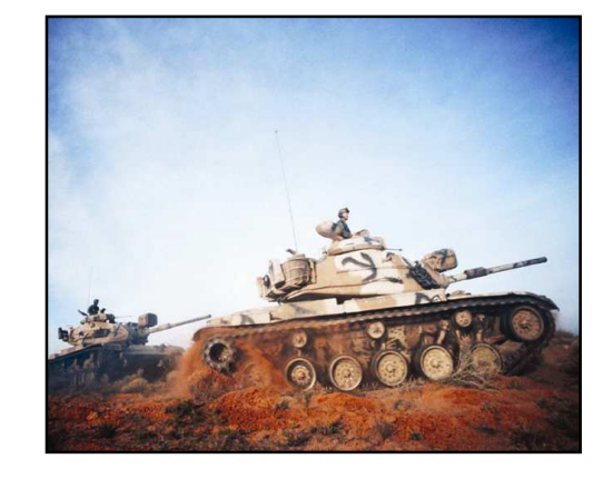
Telex has built speakers, microphones and headsets for the US Military for over 50 years.