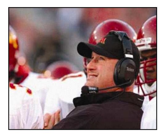
Telex builds sideline communications systems for professional and college football.