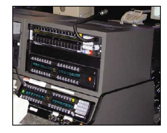
Telex builds control room communications systems for every major broadcast network.