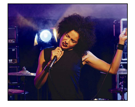
Telex builds microphones for some of the world's best known performers.