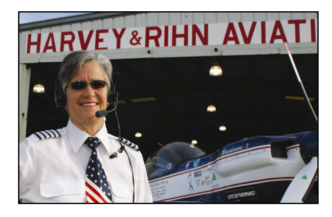
Telex builds aviation headsets for more than half of the commercial pilots in the US.