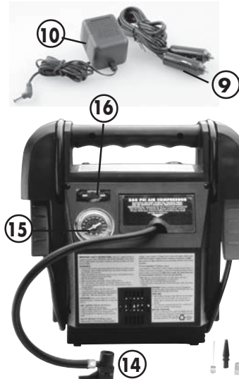
FIGURE 1B (REAR VIEW)