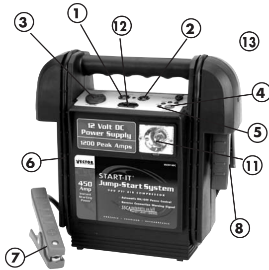
FIGURE 1A (FRONT VIEW)