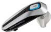
Plantronics Discovery 655 Outstanding looks. Standout sound quality.