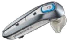
Plantronics Discovery 630 Compact and comfortable.