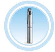
Vibrating charging pocket with AAA battery charger (included with Discovery 655 & 650E)