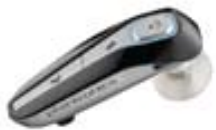
Plantronics Discovery 665 Drive business, conduct meetings and sound your best anywhere—including in the car!