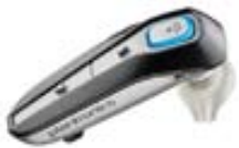
Plantronics Discovery 650 Multi-tasking. Always moving. We're right there with you.