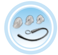
Customizable soft gel ear tips (S, M, L) and optional ear loop for stability (included with all Discovery headsets)

For an interactive demo of AudiolQ and QuickPair visit www.plantronics.com