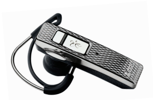
i.VoicePRO™ Bluetooth Headset