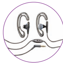
inEar | Earclips-S UHP307

Master Carton Quantity: 4 Master Carton Dimensions: 6.0" (W) x 7.25" (D) x 9" (H) Display Carton Dimensions: 5.5" (W) x 1.63" (D) x 7" (H) Master Carton Weight: 35.3oz 1kg Display Carton Weight: 9.5oz 0.3kg