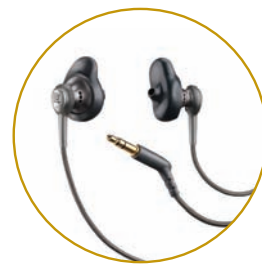
inEar | Earbuds UHP101

Master Carton Quantity: 4 Master Carton Dimensions: 6.0" (W) x 7.25" (D) x 9" (H) Display Carton Dimensions: 5.5" (W) x 1.63" (D) x 7" (H) Master Carton Weight: 29.6oz 0.8kg Display Carton Weight: 6.7oz 0.2kg