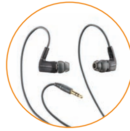
inEar | Earphones UHP336

Master Carton Quantity: 4 Master Carton Dimensions: 6.0" (W) x 7.25" (D) x 9" (H) Display Carton Dimensions: 5.5" (W) x 1.63" (D) x 7" (H) Master Carton Weight: 29.6oz 0.8kg Display Carton Weight: 5.6oz 0.2kg