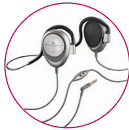
onEar | Neckband UHP303

Master Carton Quantity: 4 Master Carton Dimensions: 7.5" (W) x 11.75" (D) x 9" (H) Display Carton Dimensions: 7.69" (W) x 2.88" (D) x 9.19" (H) Master Carton Weight: 61.1oz 1.7 kg Display Carton Weight: 36.4oz 1kg