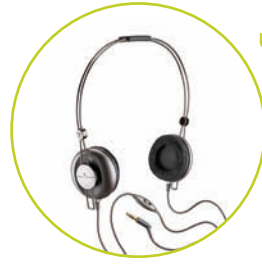
onEar | Headphones UHP304

Master Carton Quantity: 4 Master Carton Dimensions: 7.5" (W) x 11.75" (D) x 9" (H) Display Carton Dimensions: 7.69" (W) x 2.88" (D) x 9.19" (H) Master Carton Weight: 61.9oz 1.8kg Display Carton Weight: 40.2oz 1.1kg