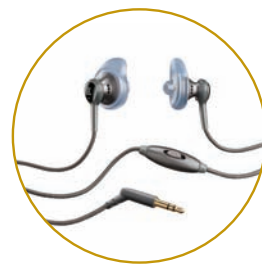
inEar | Earbuds UHP301

Master Carton Quantity: 4 Master Carton Dimensions: 7.5" (W) x 7.25" (D) x 9" (H) Display Carton Dimensions: 7" (W) x 1.63" (D) x 7" (H) Master Carton Weight: 29.6oz 0.8kg Display Carton Weight: 6.7oz 0.2kg