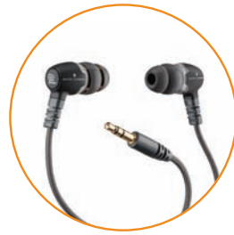
inEar | Earphones UHP306

Master Carton Quantity: 4 Master Carton Dimensions: 6.0" (W) x 7.25" (D) x 9" (H) Display Carton Dimensions: 5.5" (W) x 1.63" (D) x 7" (H) Master Carton Weight: 29.6oz 0.8kg Display Carton Weight: 5.6oz 0.2kg