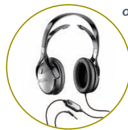
overEar | Headphones UHP405 SRS® Surround Sound

Master Carton Quantity: 2 Master Carton Dimensions: 18.25" (W) x 9.75" (D) x 11" (H) Display Carton Dimensions: 9.13" (W) x 4.5" (D) x 9.13" (H) Master Carton Weight: 46.8oz 1.3 Kg Display Carton Weight: 14.6oz 0.4kg