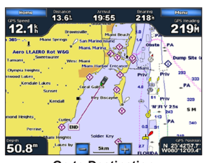
Go to Destination