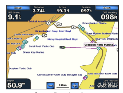
Go to Destination