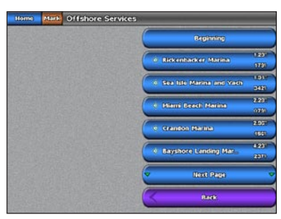
List of Marine Service Items