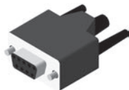
GPS 18 PC (DB-9 Serial) connector