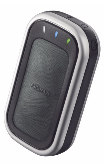
9236274 Issue 1