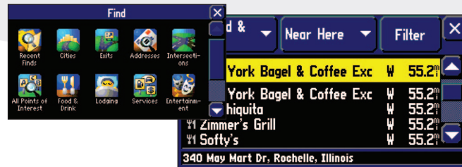
Screen shown with MapSource City Navigator data

Use the "find" feature to select an attraction or point of interest. 2