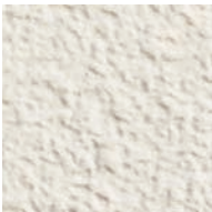
White Embossed Stucco Finish