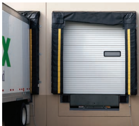
Vision Lites allow for visibility while maintaining security