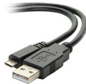
Type A to Micro-B cable (2444B5)