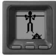
SLIM: Pull Up