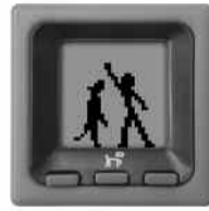
SCOOP: Keep Away