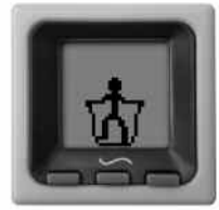
WHIP: Jump Rope

MOTION SENSORS - Play with and pester each STICK MAN™ by shaking or tumbling the cube.