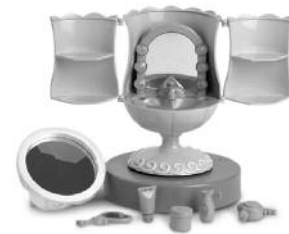
Ice Cream Sundae Vanity