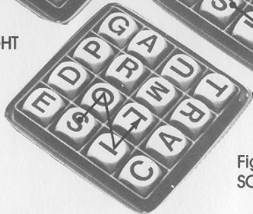
Figure 3 SOIL

Figures 1 through 3 show how words can be formed using the adjoining letters S,O,I,L.