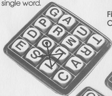
Figure 1 OILS (and OIL)

Words are formed from adjoining letters . Letters must join in the proper sequence to spell a word. They may join horizontally, vertically, or diagonally to the left, right, or up-and-down. No letter cube, however, may be used more than once within a single word.