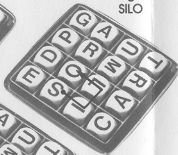
Figure 2 SILO