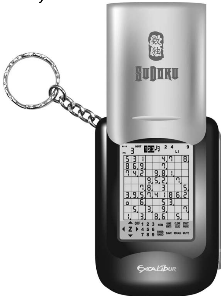
Model No. K452-CS