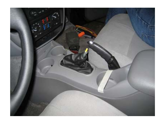
Mark Measurement with tape.