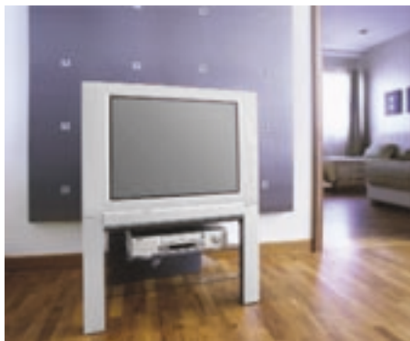
Shown above with optional TC27PV2 stand and accessory.