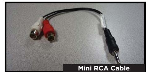
Mini RCA Cable