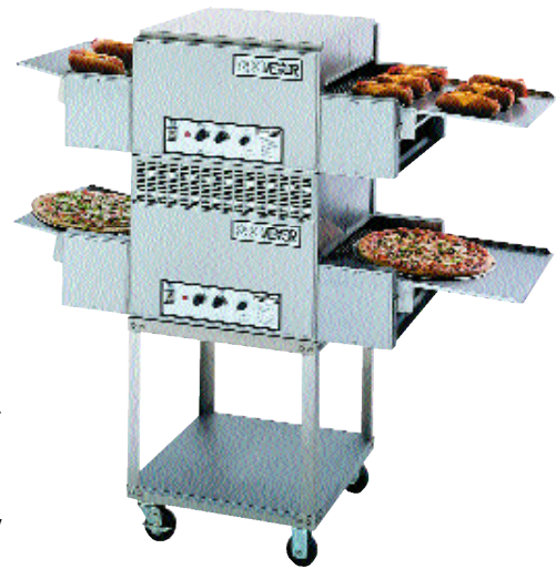
Model 314HX Stacked

Proveyor ovens are covered by Holman's one year parts and labor warranty.