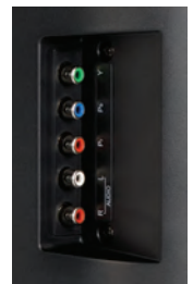
2 - Component Video and Audio Inputs