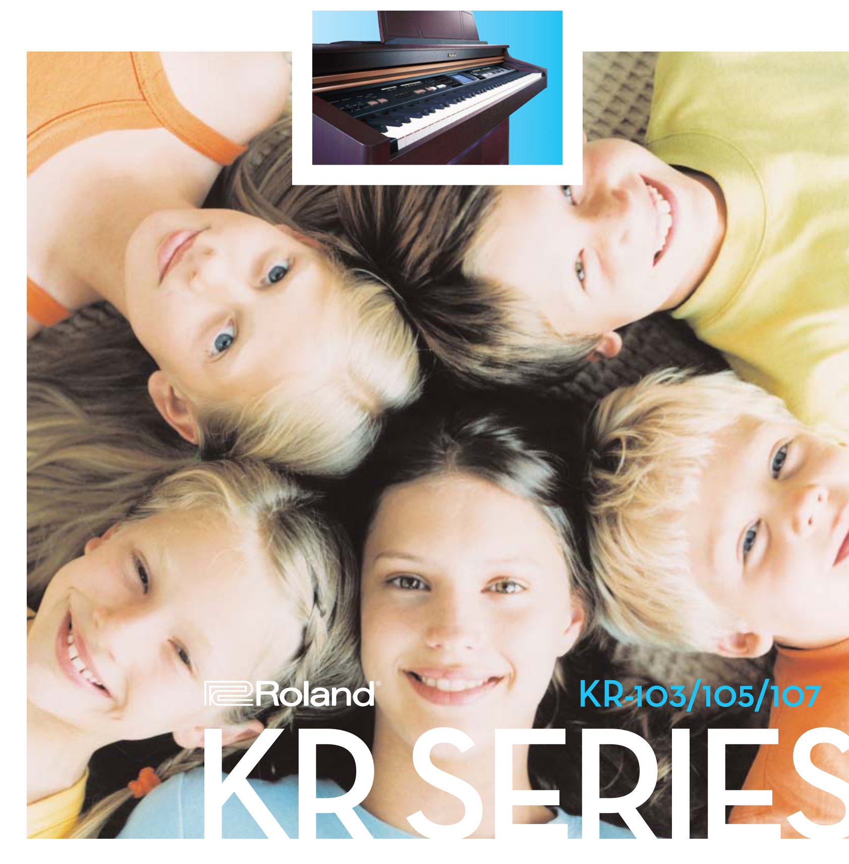
digital intelligent pianos