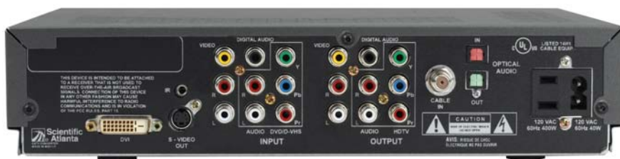
3250HD rear panel showing optional loop-through connections