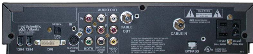
3250HD rear panel showing optional IEEE 1394 digital outputs

Taping an HD broadcast to an analog VCR is seamless with the 3250HD. The set-top simultaneously displays the HD image and downconverts it to SD (standard definition) through the NTSC outputs.