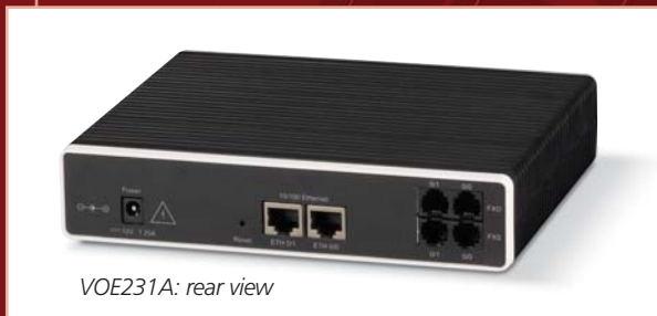
VOE231A: rear view