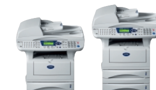
MFC-8440 Without / with lower tray ■ Optional Network Interface

An increasingly popular function. Scans can be generated through the flatbed or the auto document feeder. The 'Scan' key offers flexibility by enabling you to scan directly to OCR, E-mail, Image or File. The resolution is high at up to 9600x9600 dpi (Interpolated). Besides these four main functions, this all-in-one machine also offers: Simultaneous operation, which means that, for example, you can start scanning while a print-out is being generated or print a document whilst sending a fax. A large, five line back-lit display helps make operation simple – as do the clear instructions it shows. Back-lit keys for Fax, Copy and Scan enable instant access to each function.