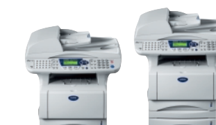
MFC-8840DN Without / with lower tray ■ Duplex printing as standard ■ Network Interface as standard