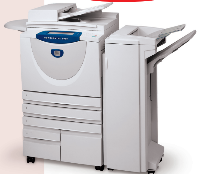
WorkCentre 5050 with optional Office Finisher

An easy-to-use touchscreen control panel provides convenient access to advanced capabilities.