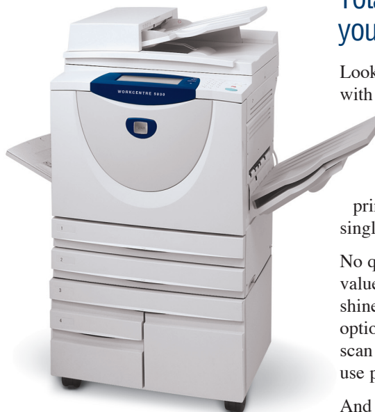
WorkCentre 5030 with Offsetting Catch Tray option

When it comes to rock-solid performance, these devices are in a class of their own. Built for endurance, they deliver day-in, day-out reliability. And image quality? Truly world-class. The WorkCentre family's patented AutoIQ can instantly monitor and adjust settings for optimum output.