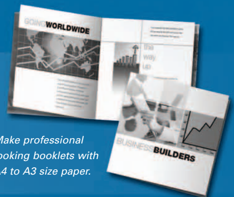
Make professional looking booklets with A4 to A3 size paper.

For instance, the high volume drawer configuration is flexible enough to meet whatever paper requirements you might have. Including the standard 2,500 sheet large capacity main drawer, the system provides 3,600 sheets on line in basic configuration. A 100 sheet Smart Stack Feed bypass and optional 4,000 sheet external LCF provides up to 7,600 sheets on line from five separate sources. You have all the capacity you need, whenever you need it.