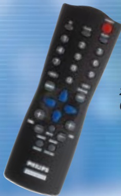
29-Button Total Remote (Remote# RCL9UB/04)