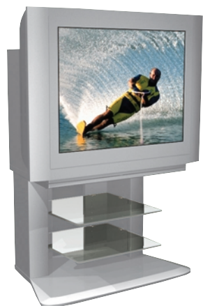
Shown above with optional matching PH321RFS stand.