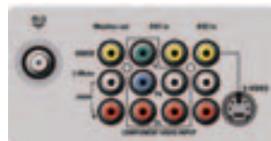
Rear AV Input/Outputs