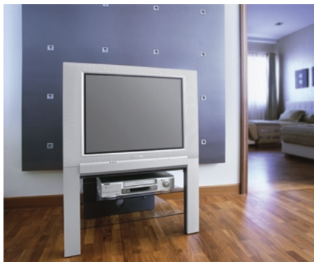
Shown above with optional TC27PV2 stand and accessory.