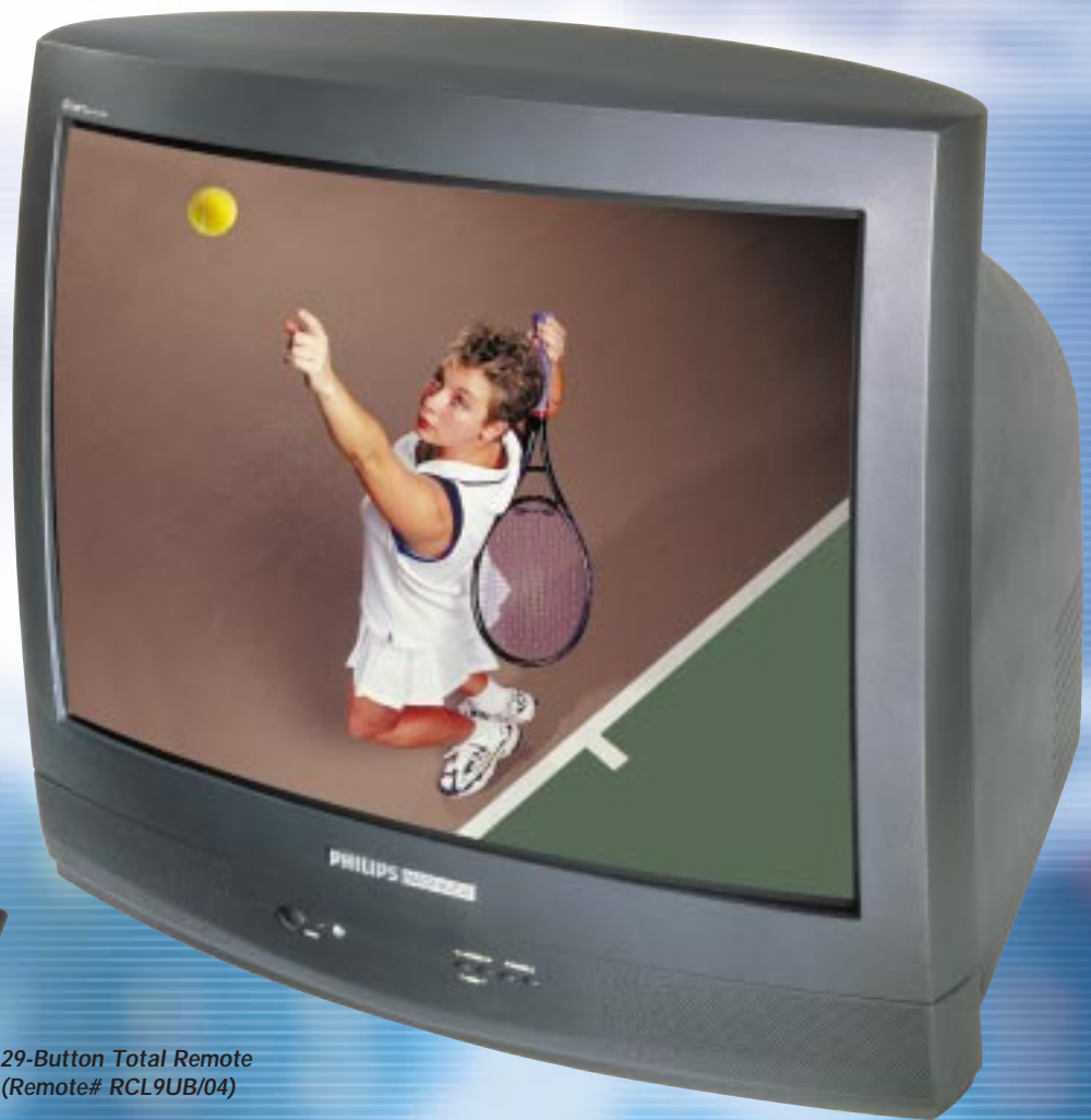
29-Button Total Remote (Remote# RCL9UB/04)