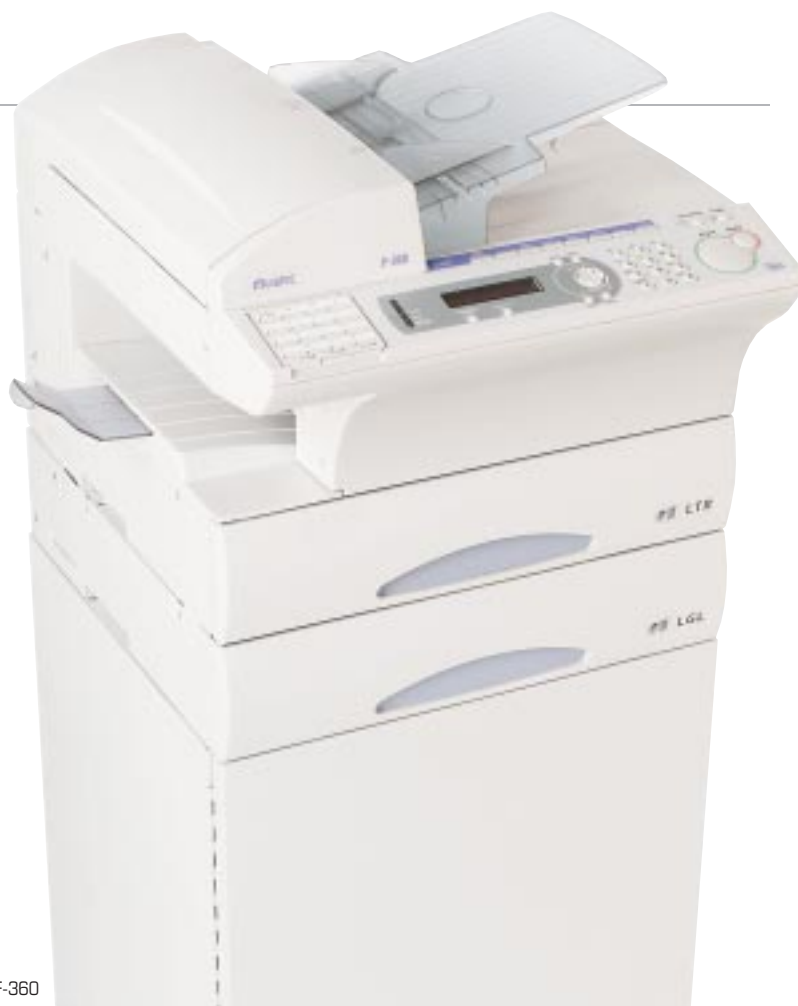
F-320 and F-360

OfficeBridge I-Fax maximizes the performance of the Muratec F-320 and F-360, giving users the ability to perform multiple tasks at a single, convenient location.