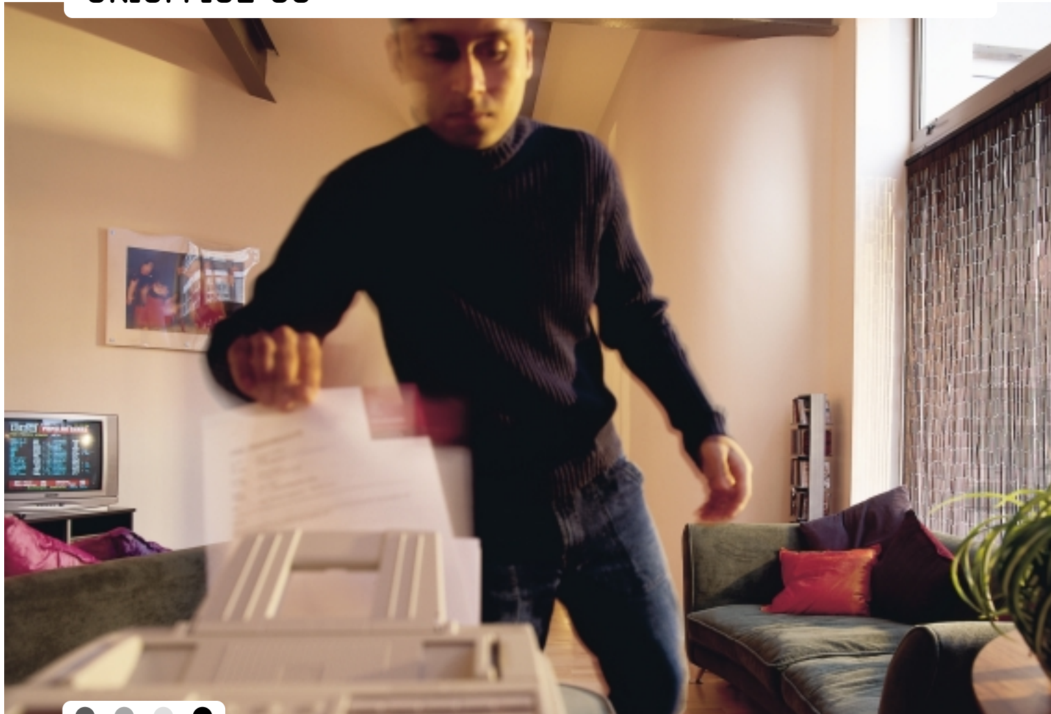
❖ OKIOFFICE 86