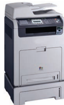
MFX-C2500 Professional Edition shown with 2nd cassette

Muratec America, Inc. 3301 East Plano Parkway, Suite 100, Plano, Texas 75074 For more information on Muratec products or services, call (469) 429-3300 or visit our web site at www.muratec.com