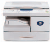
copy | print