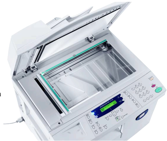
The WorkCentre 4118 brings full-featured copying, with optional faxing and scanning capabilities, to your office environment.

Building on a strong set of print and copy features, the WorkCentre 4118x configuration adds fax functionality to the mix. 33.6 Kbps transmission speeds, compression methods including MH, MR, MMR, JBIG, and JPEG, and 8 MB of dedicated fax memory create a high-performance fax solution. Up to 13 redial attempts can be set to occur in 1 to 15 minute intervals to help your faxes reach their destination without manually resending. 200 speed dial settings also help ease the process of sending faxes, and advanced features include the ability to send color faxes, the ability to receive confidential faxes, 72-hour battery backup, timers for delayed transmitting, and sending batch files. The WorkCentre 4118x also enables setting up password protected mailboxes for storing frequently used documents, fax forwarding, fax polling and more.