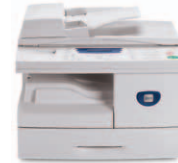
copy | print | scan | fax