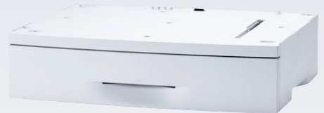
Additional 550-sheet Paper Tray