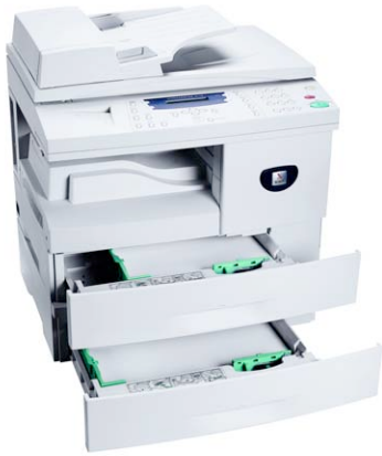
The WorkCentre 4118 offers paper capacity of up to 1,200 sheets - helping you maximize productivity.