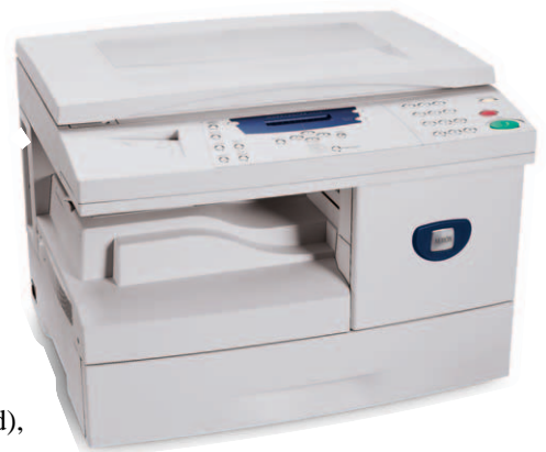
WorkCentre 4118p configuration