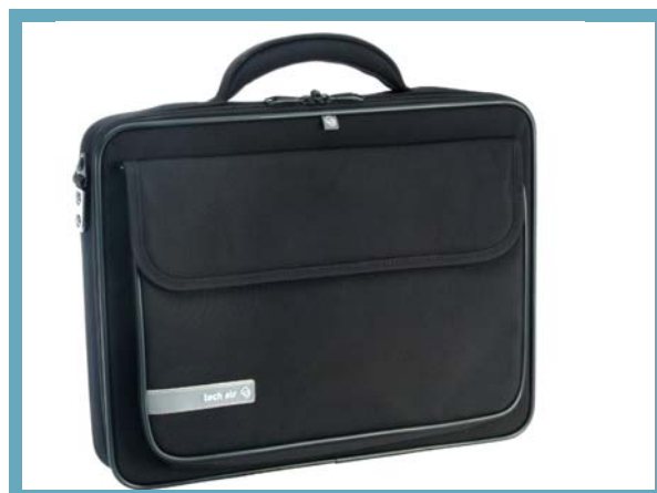
TAN3102HY Classic Clam