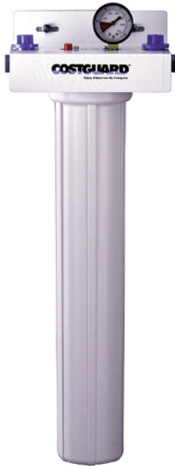
CGS-20 20" Single Housing: DEV9100-20